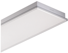
TCS760 C 2xTL5 HFP AC-MLO