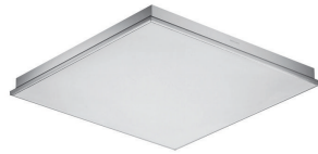
TCS760 C 4xTL5 HFP AC-MLO