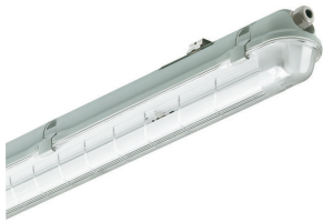
Waterproof TCW060 surface-mounted/suspended luminaire for TL-D fluorescent lamp(s)