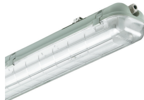
Waterproof TCW060 surface-mounted/suspended luminaire for TL-D fluorescent lamp(s)