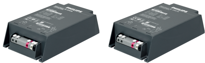
HID-PV Xt 90 CPO Q