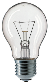
E27, A55, Clear