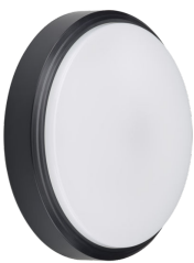
CoreLine Wall-mounted WL140V Wall-mounted Black