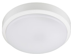
CoreLine Wall-mounted WL140V Ceiling-mounted