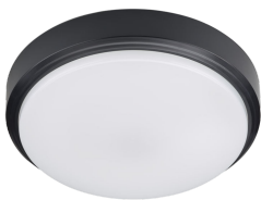
CoreLine Wall-mounted WL140V Ceiling-mounted Black