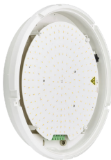
CoreLine Wall-mounted WL140V Wall-mounted Switchable Lumen & CCT