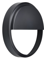
CoreLine Wall-mounted WL140V Half-moon Accessory Black