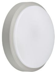
CoreLine Wall-mounted WL140V Wall-mounted Grey