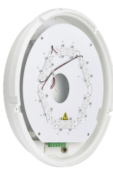
CoreLine Wall-mounted WL140V Wall-mounted PSU