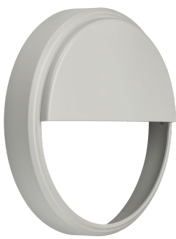
CoreLine Wall-mounted WL140V Half-moon Accessory Grey