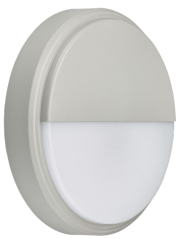
CoreLine Wall-mounted WL140V Wall-mounted Grey with Half- moon Accessory