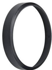
CoreLine Wall-mounted WL140V Rim Black