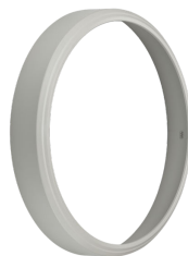
CoreLine Wall-mounted WL140V Rim Grey