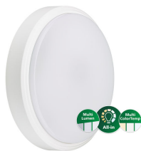
CoreLine wall-mounted WL140V All-in