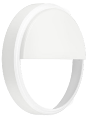
CoreLine Wall-mounted WL140V Half-moon Accessory White