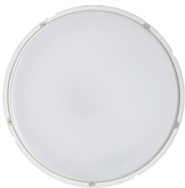
Coreline Wall-mounted WL140V Top View (with screw locations)