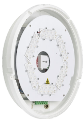
CoreLine Wall-mounted WL140V Wall-mounted PSR MDU