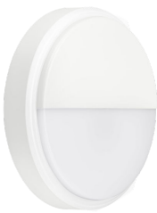
CoreLine Wall-mounted WL140V Wall-mounted White with Half- moon Accessory