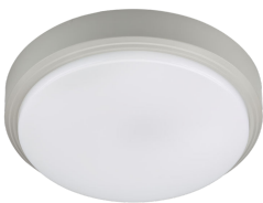
CoreLine Wall-mounted WL140V Ceiling-mounted Grey