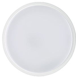
Coreline Wall-mounted WL140V Top View