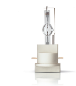
MSR Gold™ 700, 700/2, 1200 FastFit