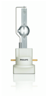
XPPR XDMSR 0015