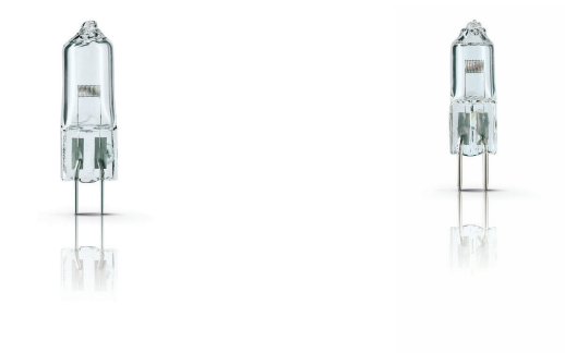
XPPR XHMPSEFF 0003