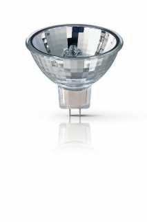
XPPR XHOPDI 0001