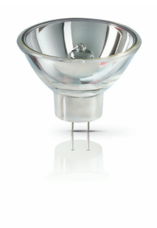
XPPR XHOPDI 0005