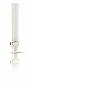
XPPR XUVBPLS 0001