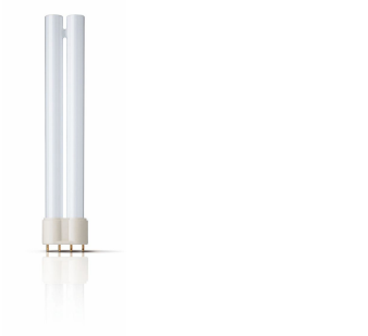
XPPR XUMPLL 2G11