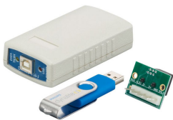
DTK622 Network Gateway