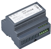
DDNP1501 Product shot