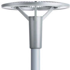
Smart LED Post-top BGP151 pedestrian luminaire