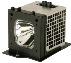
MODULE, Hitachi UX21513