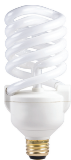
11-34W, E26, Dimmable