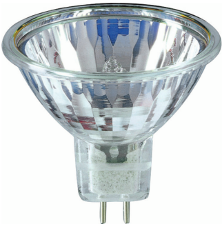
LPPR HFIGHTER Open