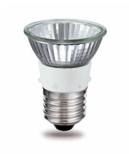
LPPR HJDR E27 30D 60D