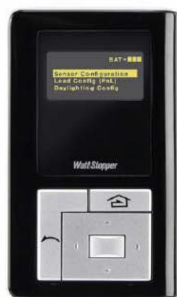
Ordercode Prog MR Rem