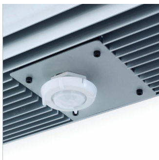
Ordercode Prog MR