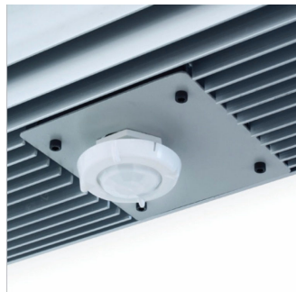
Ordercode Prog MR