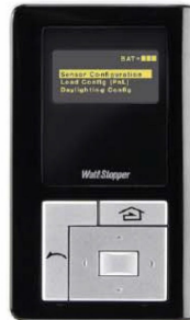
Ordercode Prog MR Rem