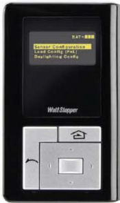
Ordercode Prog MR Rem