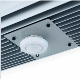
Ordercode Prog MR