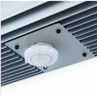
Ordercode Prog MR