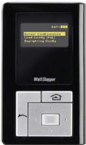
Ordercode Prog MR Rem