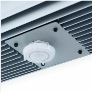
Ordercode Prog MR