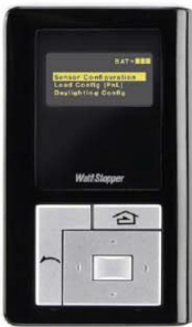
Ordercode Prog MR Rem