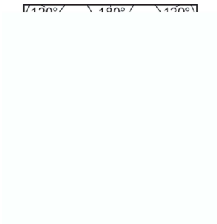
Light Distribution Diagram - MASTERLine 111 30W G53 12V 8D 1CT/6