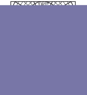
Light Distribution Diagram - Refl 25W E14 230V NR50 30D 1CT/30