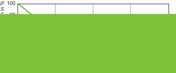
Lumen Maintenance Diagram - MASTER HPI Plus 400W/645 BUS E40 1SL/6