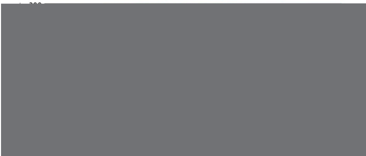
Spectral Power Distribution Colour - MASTERC CDM-TC 35W/842 G8.5 1CT/12