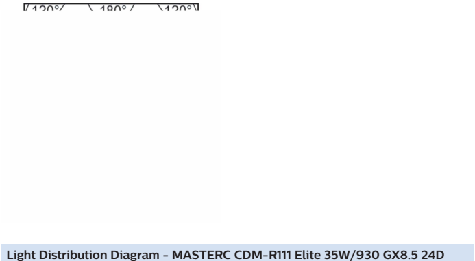
Light Distribution Diagram - MASTERC CDM-R111 Elite 35W/930 GX8.5 24D