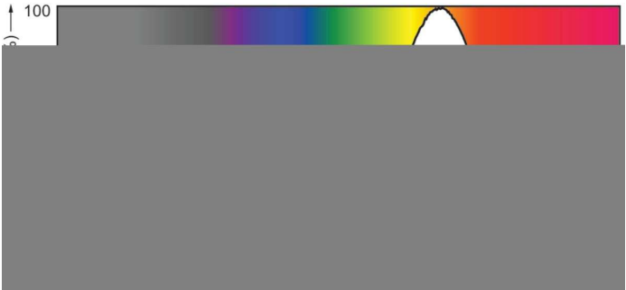
Light Distribution Diagram - 7MR16/F36 2700 DIM HO