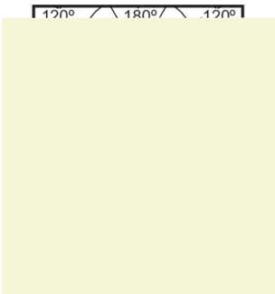
Light Distribution Diagram – MAS LEDtube HF 1200mm SO 16.5W 840 T8 RN