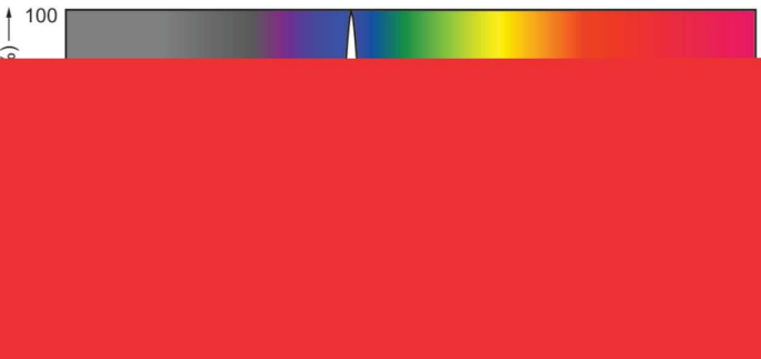
Spectral Power Distribution Colour - CorePro LEDtube 1500mm 20W 865 C