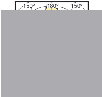
Light Distribution Diagram - MAS LEDcandle DT 4-25W E14 BA38 CL