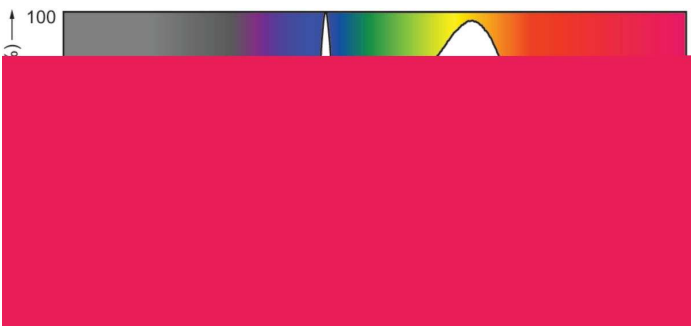
Light Distribution Diagram - MAS LEDtube 1200mm UO 18W 840 T8 RS