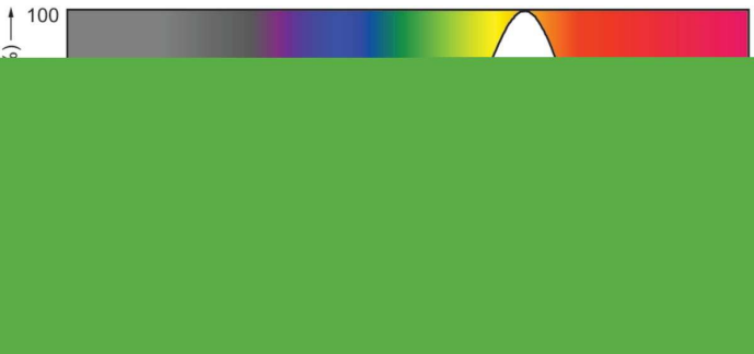
Light Distribution Diagram - 6.4MR16/F35/3000 DIM 12V