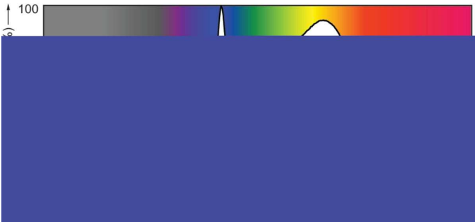
Spectral Power Distribution Colour - MAS LEDtube 900mm 15W840 T8 RN