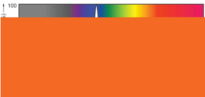
Spectral Power Distribution Colour - Master LEDTube 600 mm 10W 865 T8 I W