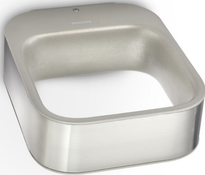
PHILIPS myGarden Wall light Moonbow inox LED