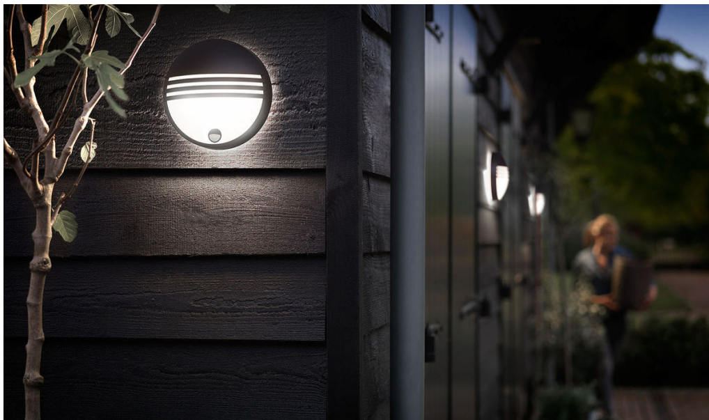
PHILIPS myGarden Wall light Yarrow 4000K black LED