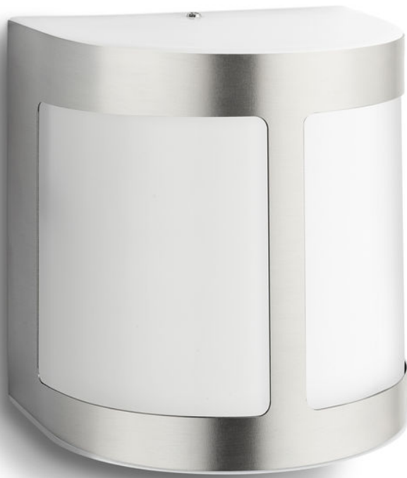
PHILIPS myGarden Wall light Parrot inox LED