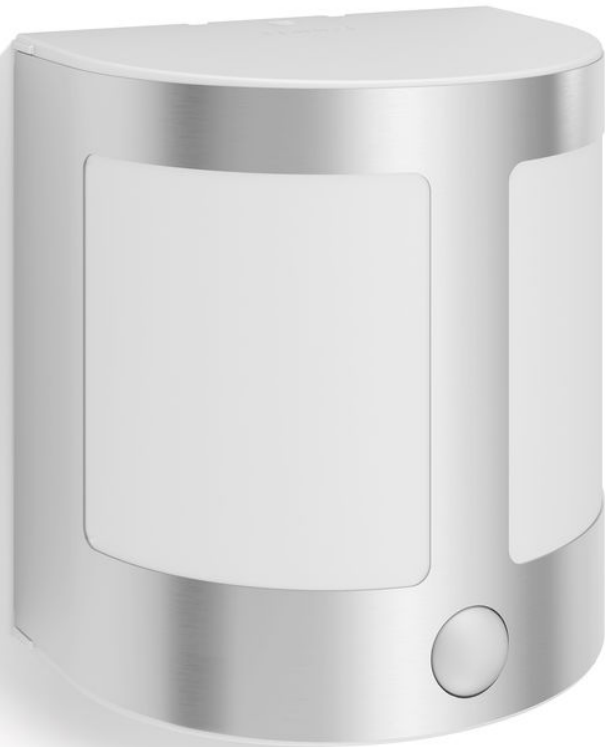
PHILIPS myGarden Wall light Parrot inox LED