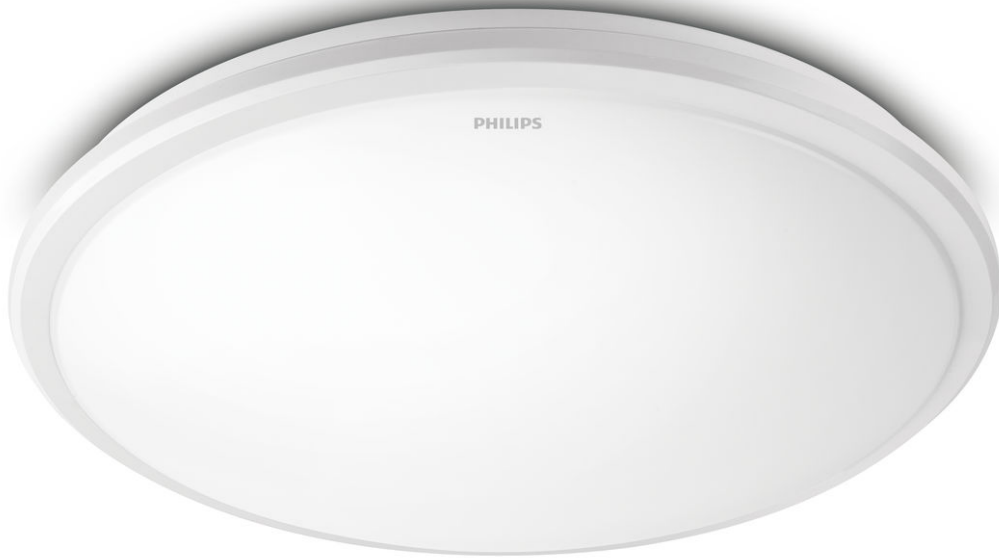
PHILIPS Ceiling light 31816 65K SLIMLINE OYSTER 20W white LED