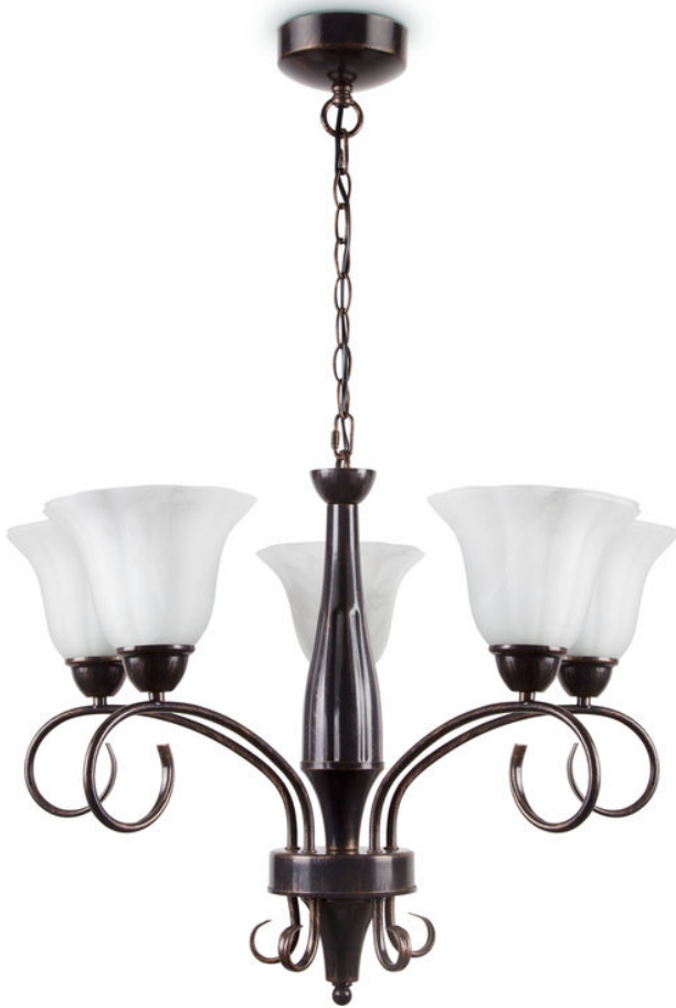
PHILIPS myLiving Suspension light 45128 Lily brown