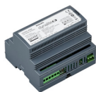
DDNG-KNX KNX Network Gateway

Due to continuous improvements and innovations, specifications may change without notice.