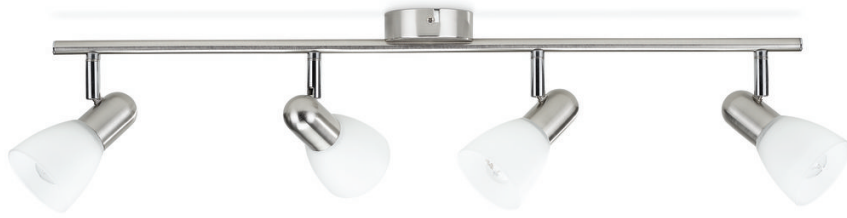
PHILIPS Essentials Spot light Burlap matt chrome