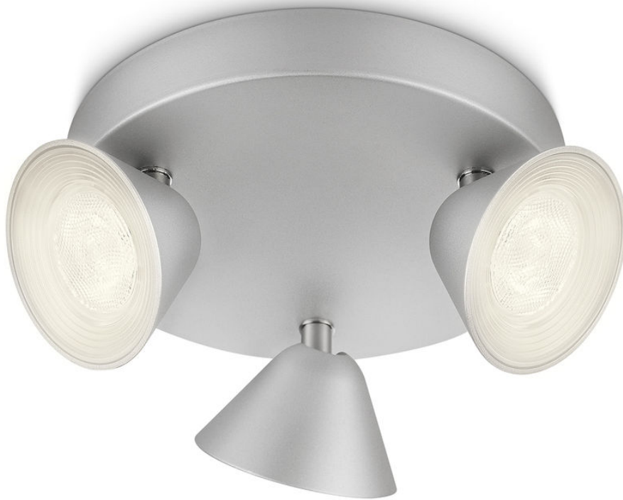
PHILIPS myLiving Spot light TWEED aluminium LED