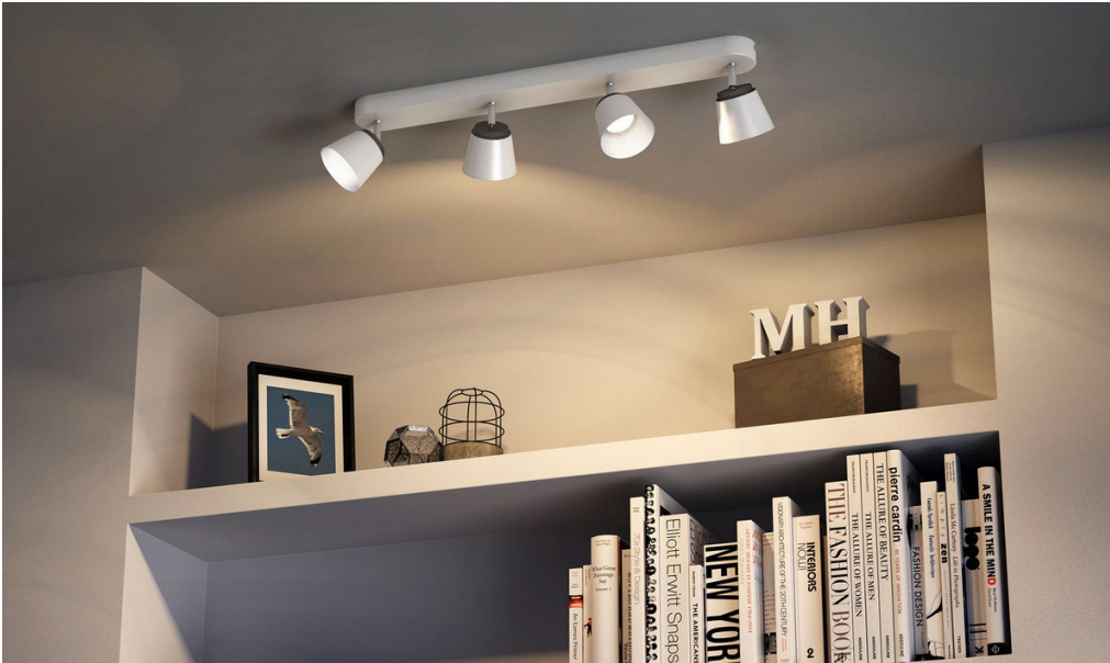
PHILIPS myLiving Spot light Dender white LED