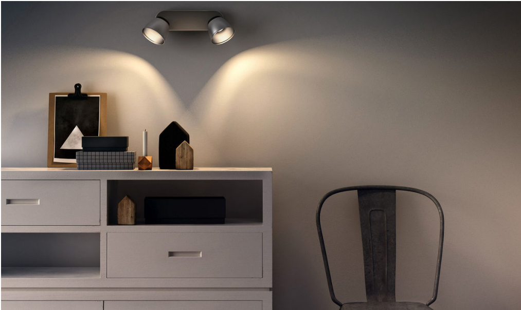
PHILIPS myLiving Spot light County matt chrome LED