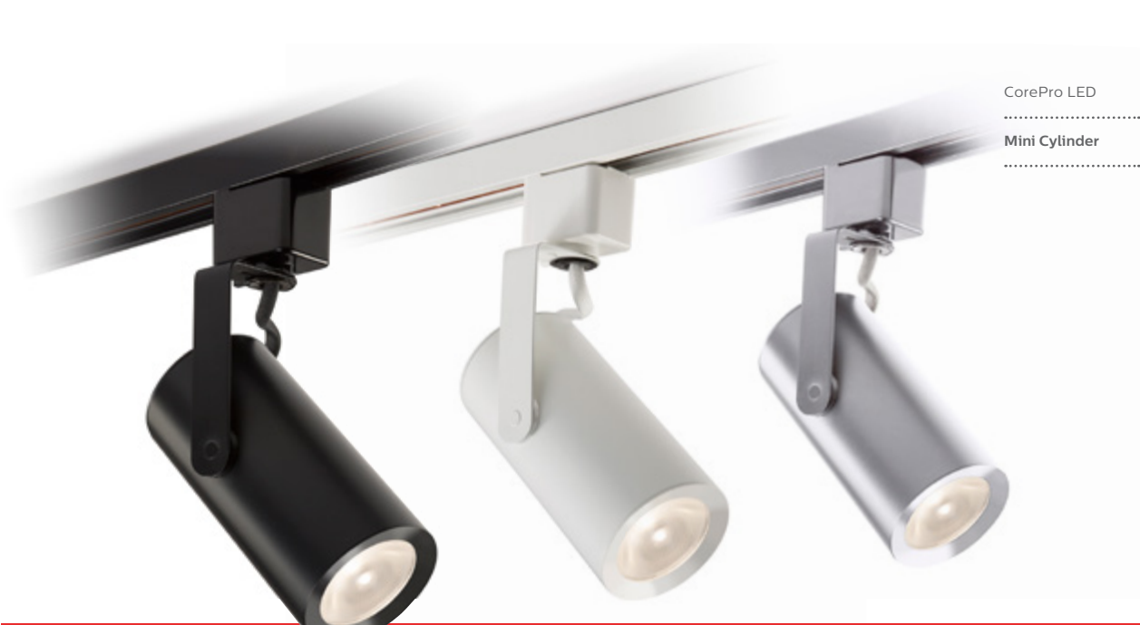
CorePro LED Mini Cylinder