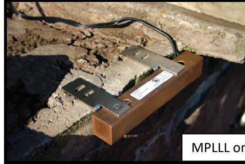
MPLLL on LLL6-AC