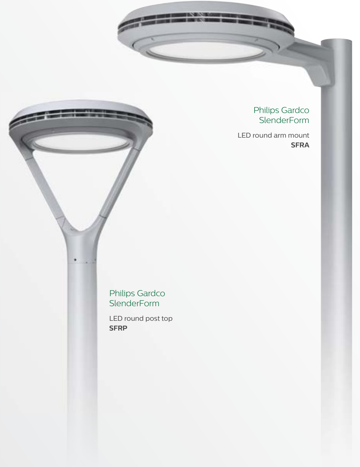
Philips Gardco SlenderForm LED round arm mount SFRA