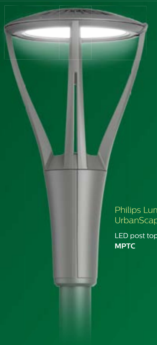
Philips Lumec UrbanScape LED post top MPTC