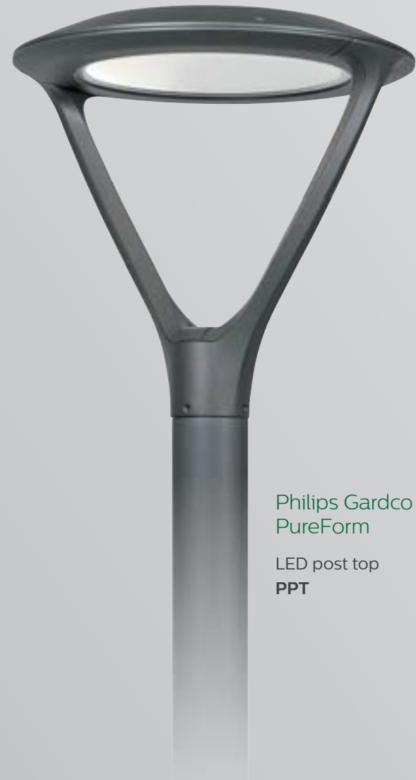
Philips Gardco PureForm LED post top PPT