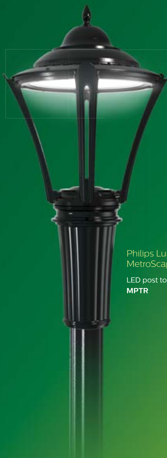
Philips Lumec MetroScape LED post top MPTR