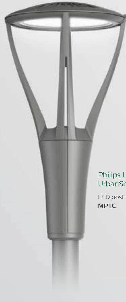
Philips Lumec UrbanScape LED post top MPTC