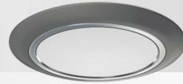
Philips Gardco SoftView LED parking garage SVPG