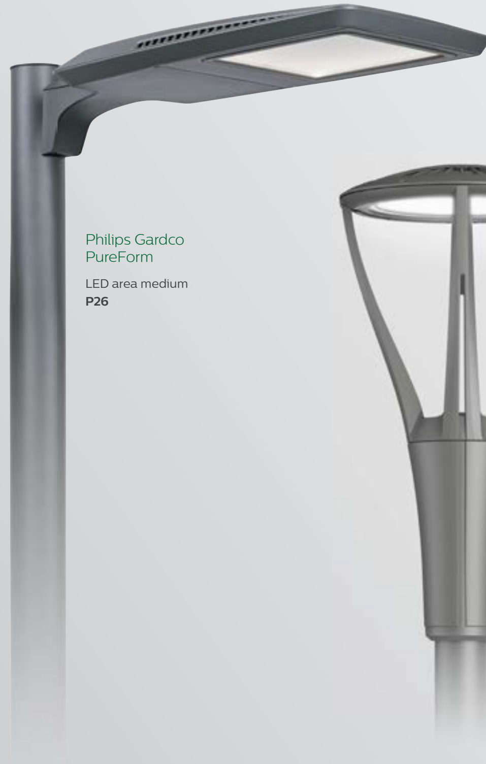
Philips Gardco PureForm LED area medium P26